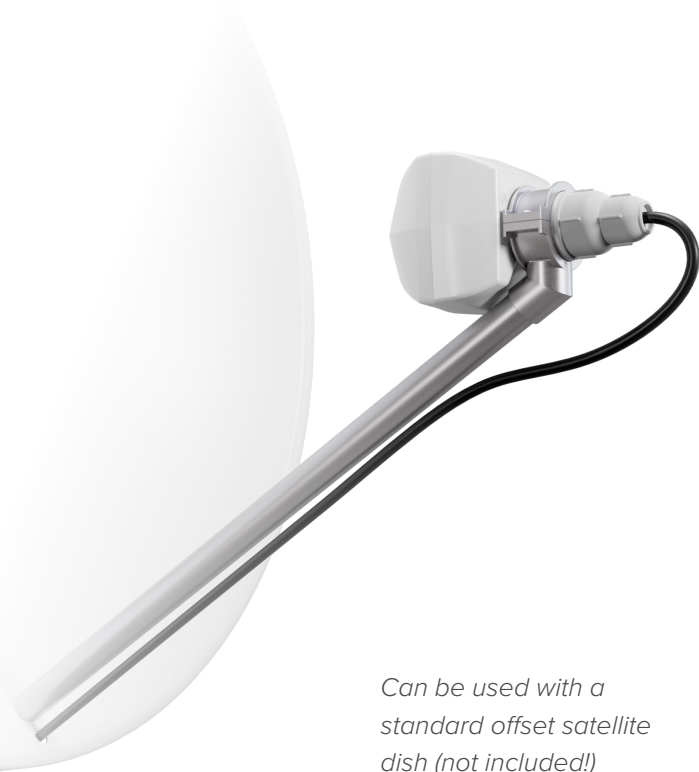
Can be used with a standard offset satellite dish (not included!)

LDF LTE6 kit is a device for extremely remote locations that are within cellular network coverage. Attach it to any satellite TV dish, and the dish will act as a reflector, greatly amplifying the signal.